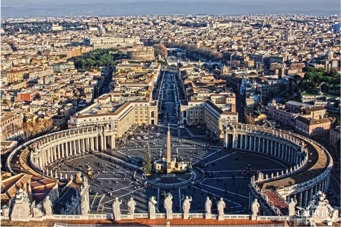
Vatican City Aerial View